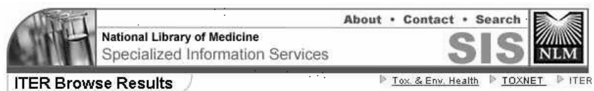
FIGURE 3. Browse ITER for Textword "Hepatotoxic"